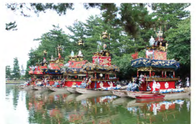
Owari Tsushima Tennoh Festival (Morning Festival)