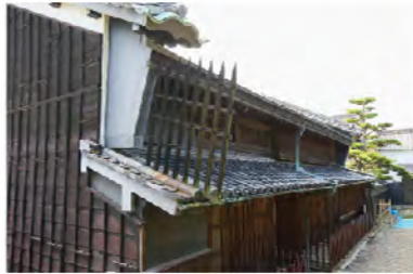
Old Hotta House