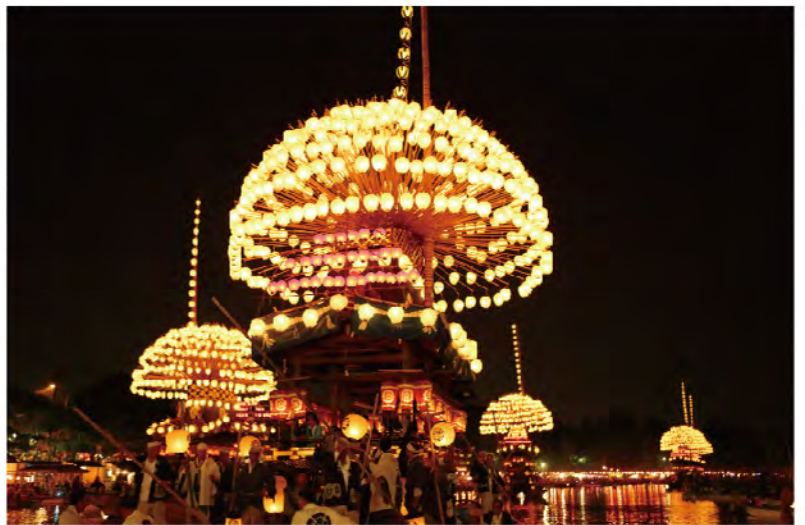
Owari Tsushima Tennoh Festival (Evening Festival)