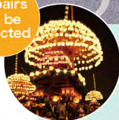
The box seats for Owari Tsushima Tenno Festival (on the list of UNESCO Intangible Cultural Heritage) on July 28, 2018