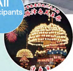
A special badge of Owari Tsushima Tenno Festival

Please fill out the questionnaire and you will have a chance to win the prize.