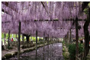
Owari Tsushima Wisteria Festival