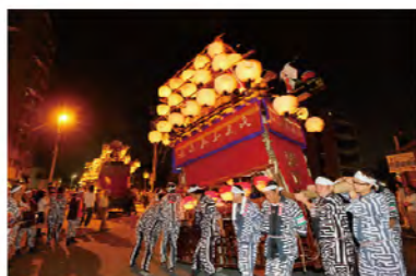
Owari Tsushima Autumn Festival